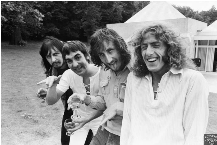
The who; a simple group despite its success.

One could say that John Entwistle was the most experienced of the group, being able to use instruments as complex and various as the trumpet, the horn, the piano, and of course the bass guitar. His musical technique was irreproachable. He anchored the group in the tempo at the time of the concerts, always being of an impeccable regularity, giving the tempo while accompanying Pete Townshend in his improvisations. He invented slap and hated rap : “singing rebellion is as easy as saying it...”.