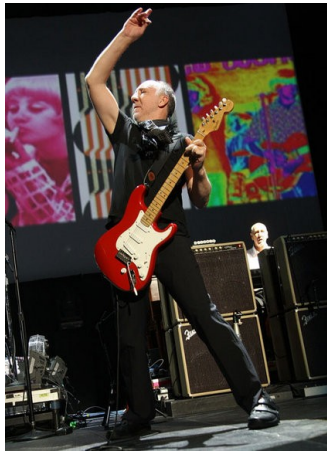
Pete Townshend and Keith Moon

They were a major influence on rock'n'roll. At its beginnings the group was called "Who" but later it changed for "The Who". In 1965, the known group had its first major hit: "I can' T explain" which did not have that success after having passed at the TV. It signed a contract with Talmy and its production. Their first album was « My generation » which was a collection of some singles written by Pete Townshend.