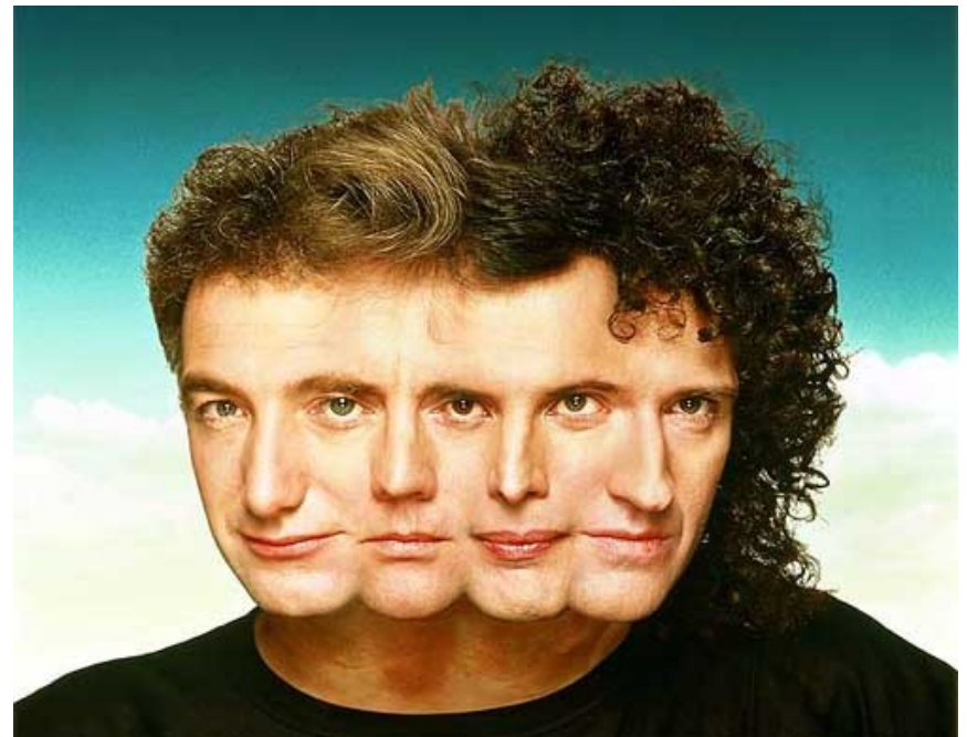
Queen's songwriting philosophy became collaborative.

The song " Bohemian Rhapsody " was re-released as a single, and became number one again. The profit was given for research against AIDS, and the members kept raising money in order to help patients suffering from this disease. With the loss of their singer, Queen performed on several occasions, welcoming guests for the vocal parts.