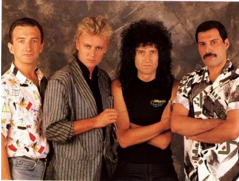
Freddie Mercury was very important for the group.

This was followed by the album The Game and the single Another One Bites The Dust , in which Queen first used a synthesizer for the first time, in opposition to their tradition. Queen released their compilation album, The Greatest Hits , which was highly successful, and was the most sold album in the United Kingdom in 2007. Taylor was the first to make his own solo album, entitled Fun In Space .