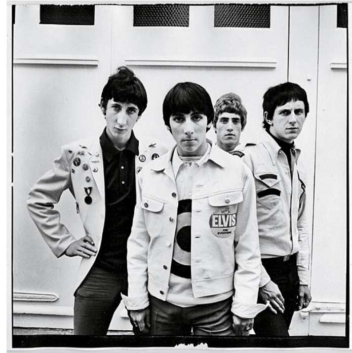
The beginning of The Who

Pete Townshend told the way in which Keith Moon joined the Who: “He came to one of our concerts, and said “I can play better than your drummer!”. Then he settled behind the drums and almost destroyed it. We immediately thought he was the man we needed . Keith Moon will keep doing this “destroying tradition“.